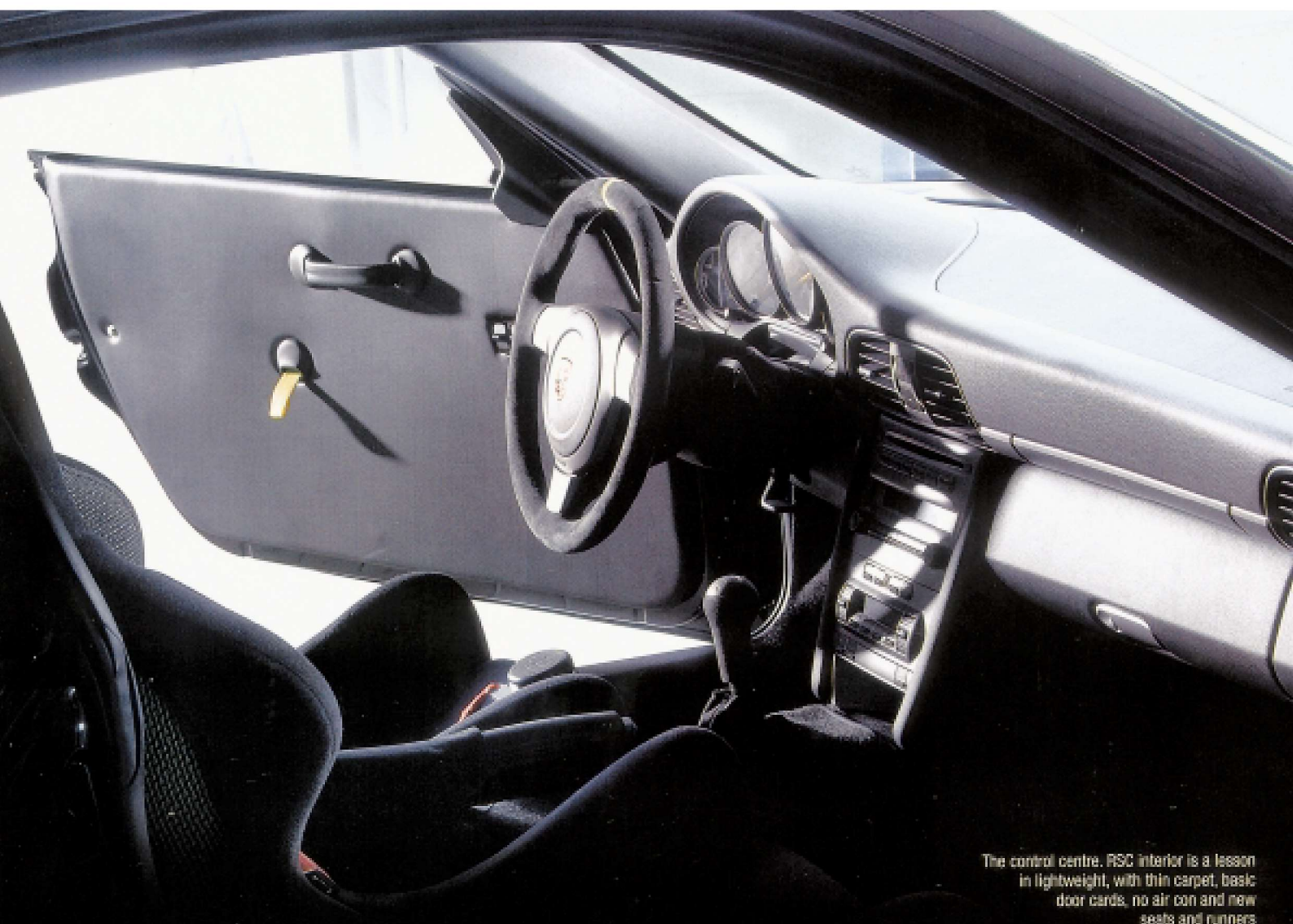
The control centre. RSC interior is a lesson in lightweight, with thin carpet, basic door cards, no air con and new seats and runners